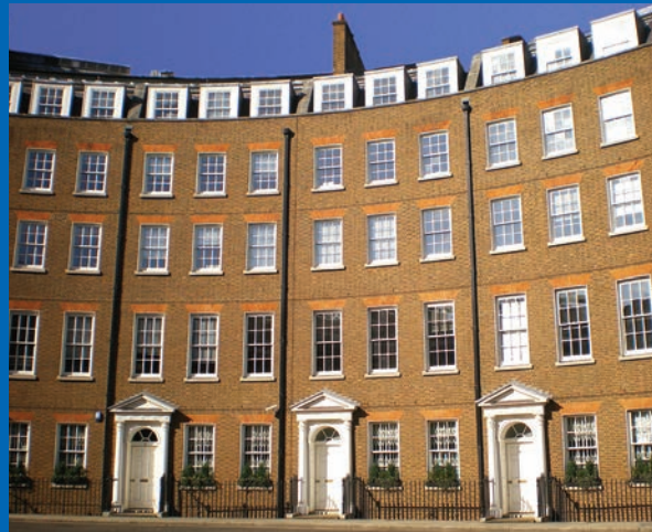
Optex Group Limited