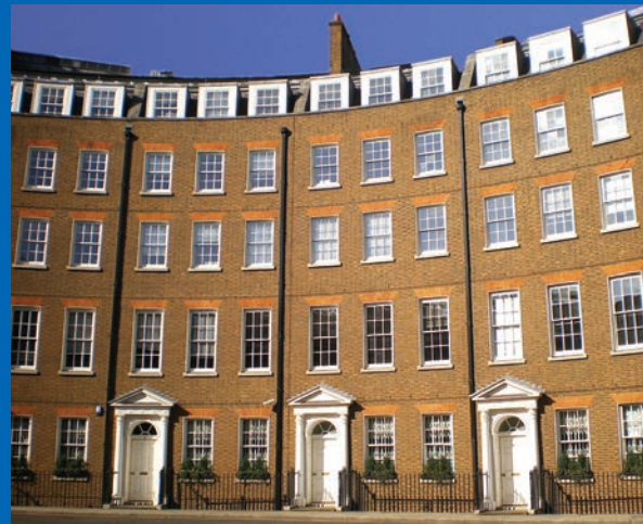
Besso headquarters in London

The International Division, formed in 1997, offers a full range of bespoke products catering for businesses, associations and private clients on a global scale. Staffed with specialists offering a range of linguistic skills, we aim to meet today's insurance challenges with a holistic approach, providing both tailored and creative insurance solutions so that our clients are able to gain the most effective commercial advantages, wherever they are in the world.