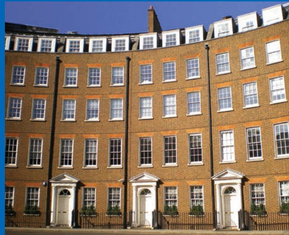
Besso headquarters in London